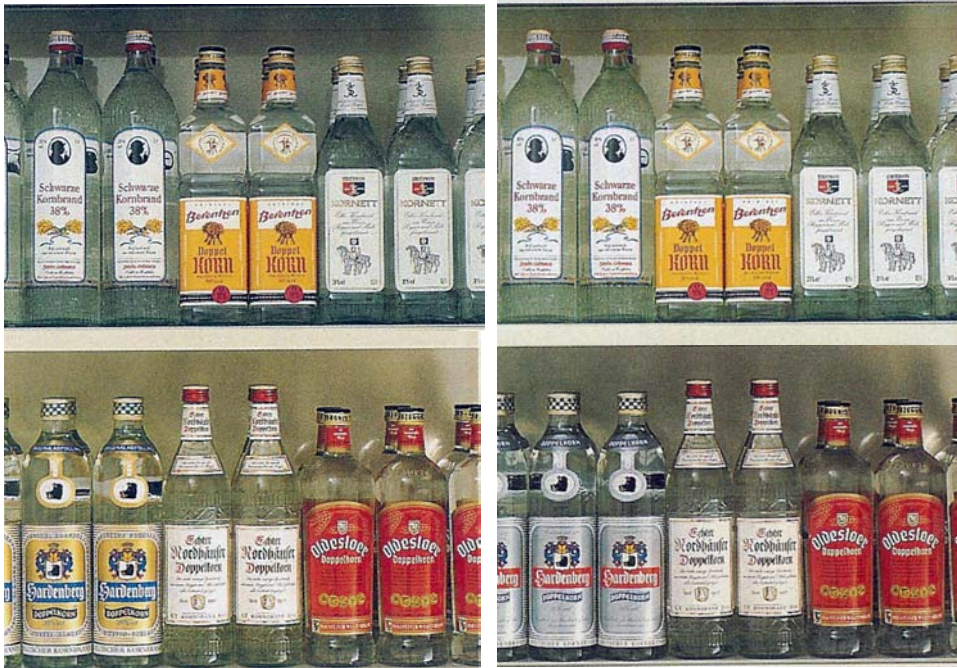
Figure 2: Doppelkorn “old”

has to be done as studio interviews using simulated shelves. As a monadic approach this pack test needs as many cells as pack designs to be tested with 120 respondents each (see figure 6).