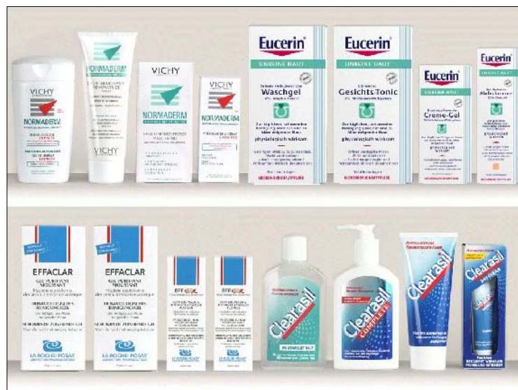
display see figure 1.